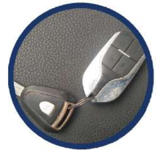
Anti Theft Alarm